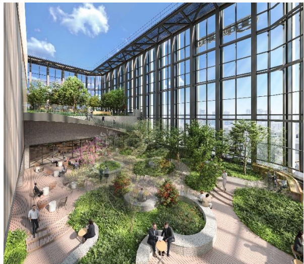
27th and 28th floors: Rooftop terrace and lounge